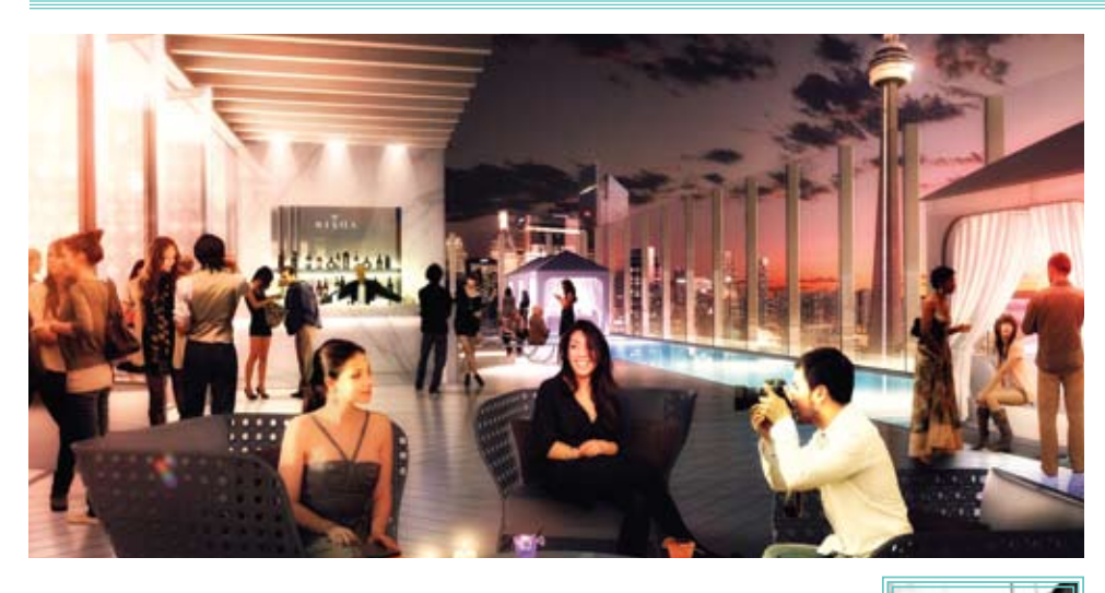
BISHA HOTEL & RESIDENCES Lifetime Developments & Ink Entertainment bisha.com